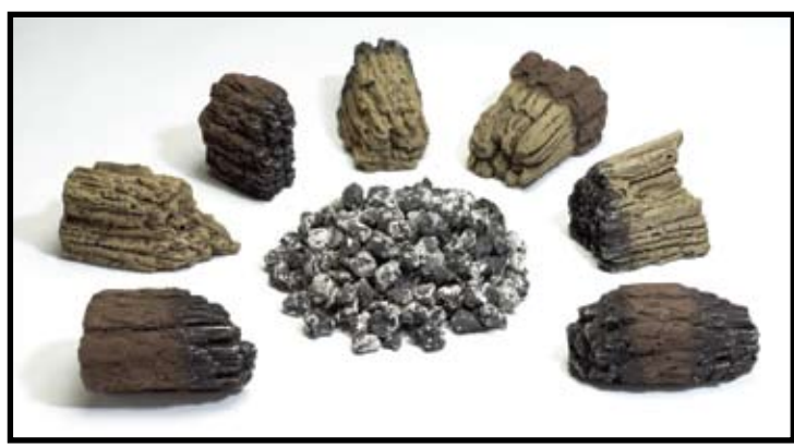
EK-2 Large Log Ember Kit includes seven large burnt log pieces and white ash