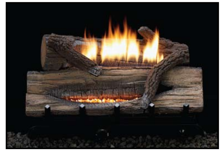
Refractory Whiskey River Log Set and burner combination (VFDR-18-LBW)

The Flint Hill and Whiskey River also offered in 10,000 Btu models for bedroom applications, where allowed by code.