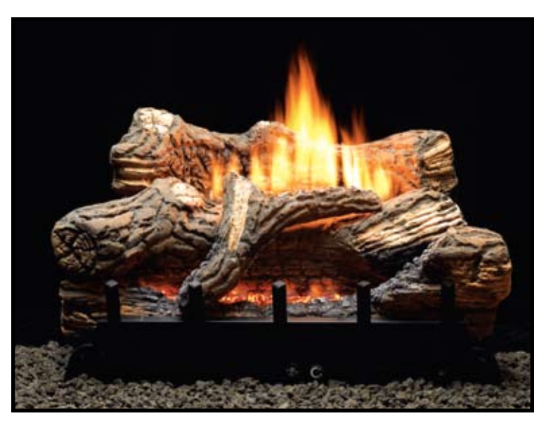
Ceramic Fiber Flint Hill Log Set and Burner Combination (VFDR-24)