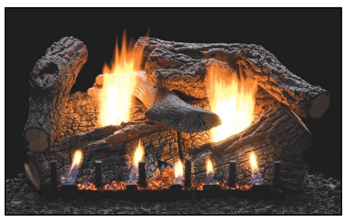
Refractory Super Sassafras Log Set (LS-24RSS) with Slope Glaze Burner System (VFSR-24)