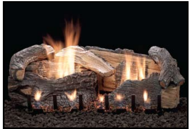
Refractory Aged Oak Log Set (LS-24RAO) with Slope Glaze Burner System (VFSR-24)

White Mountain Hearth log sets combine our proven technologies with exceptional artistry and craftsmanship to add beauty and warmth to any home.