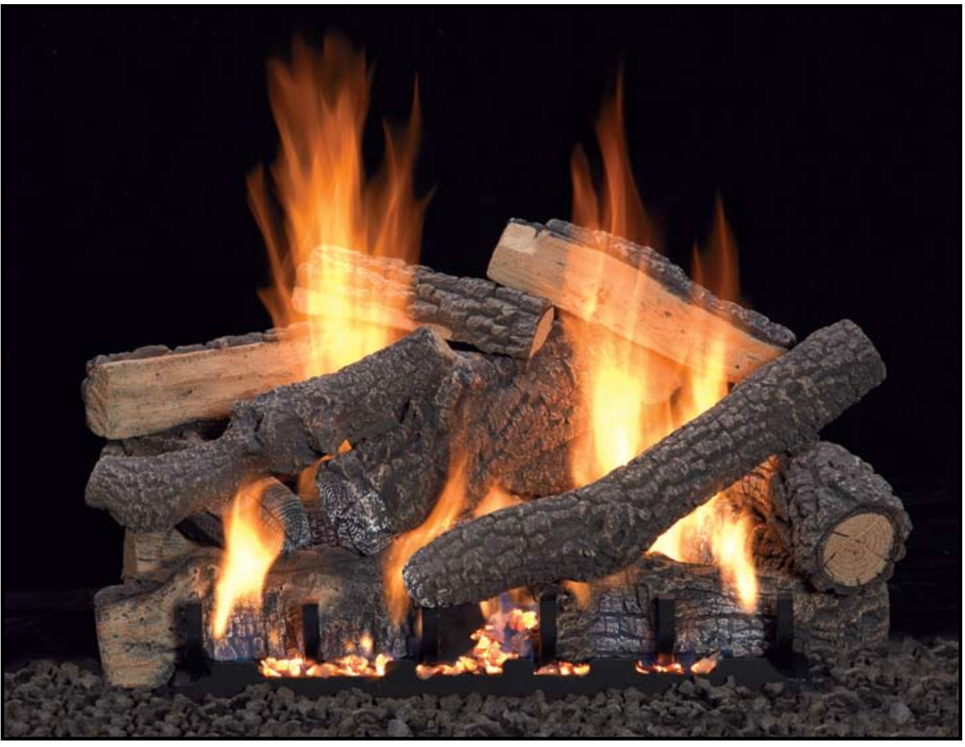
Refractory Ponderosa Log Set (LS-24P) with Vented Slope Glaze Burner System (VSR-24)