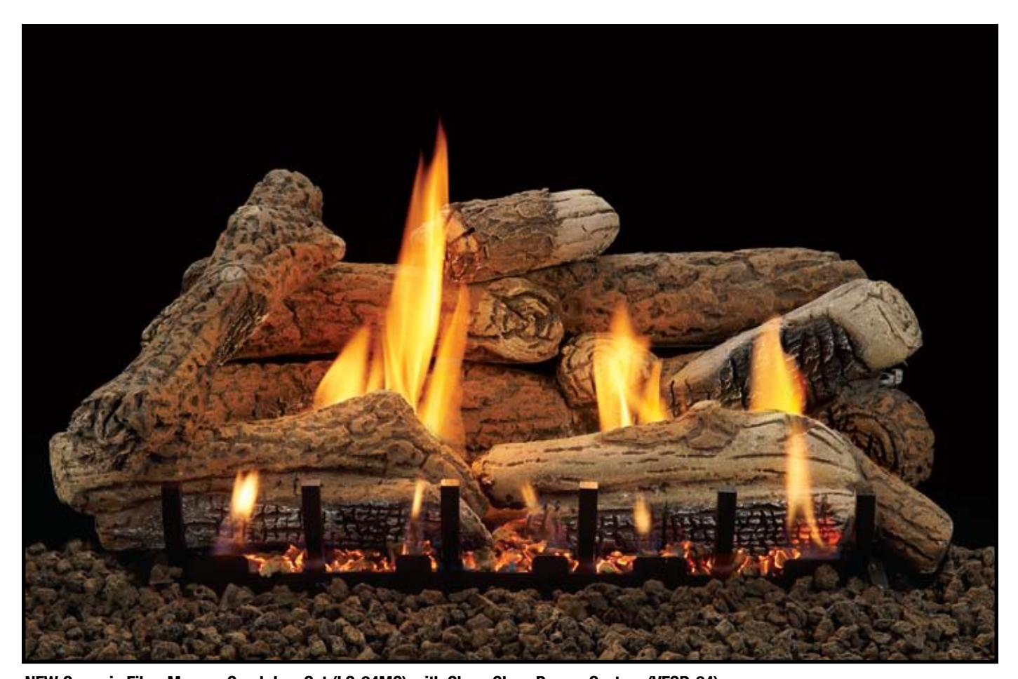
NEW Ceramic Fiber Morgan Creek Log Set (LS-24MC) with Slope Glaze Burner System (VFSR-24)