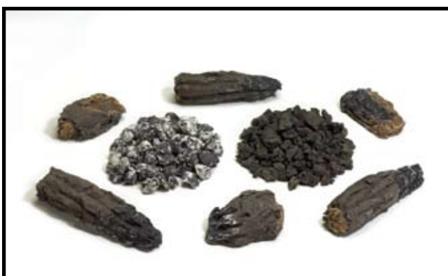
EK-1 Traditional Ember Bed Kit includes six burnt log pieces, white ash, and lava rock