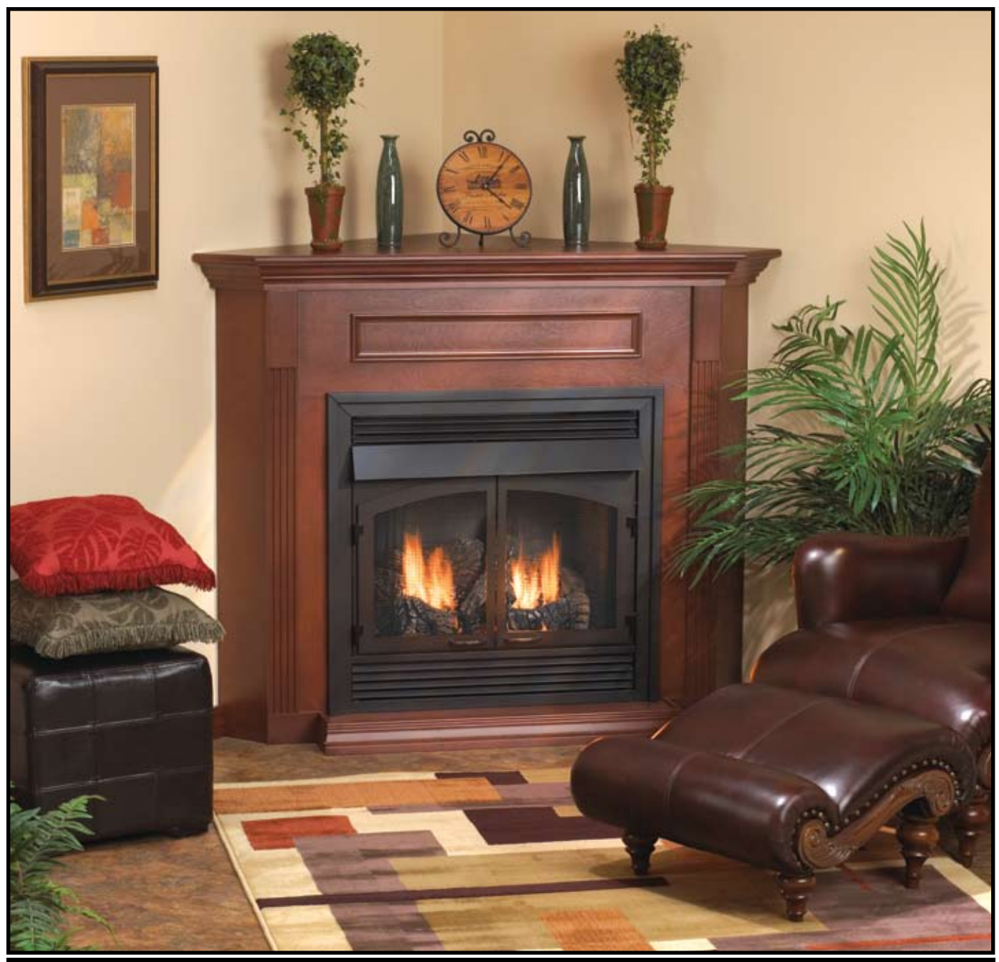
White Mountain Hearth Charred Oak Log Set (LS-24C2) on a Vent-Free Slope Glaze Burner with variable remote control system (VFSV-24). Shown with a 36-inch Breckenridge Deluxe Vent-Free Firebox with Brick Liner (VFD36FB) trimmed in black louvers, black hood, and shown with optional black frame, black door frame and black arch doors (DVF-36BL, VFY-36-SBL, and VFR-36-SCBL). The Cherry Finish on the Standard 36-inch Corner Cabinet Mantel (EMC-36-C) adds drama and warmth to any setting.

Empire Comfort Systems created the White Mountain Hearth collection to give you more options in a gas log set. With several distinct log looks, in sizes from 16 to 30 inches, this special collection helps you tailor your hearth's look to top off any room décor. Choose from our traditional lines – Charred Oak (our most popular log), Sassafras, Birch, Aged Oak or all-new Morgan Creek.