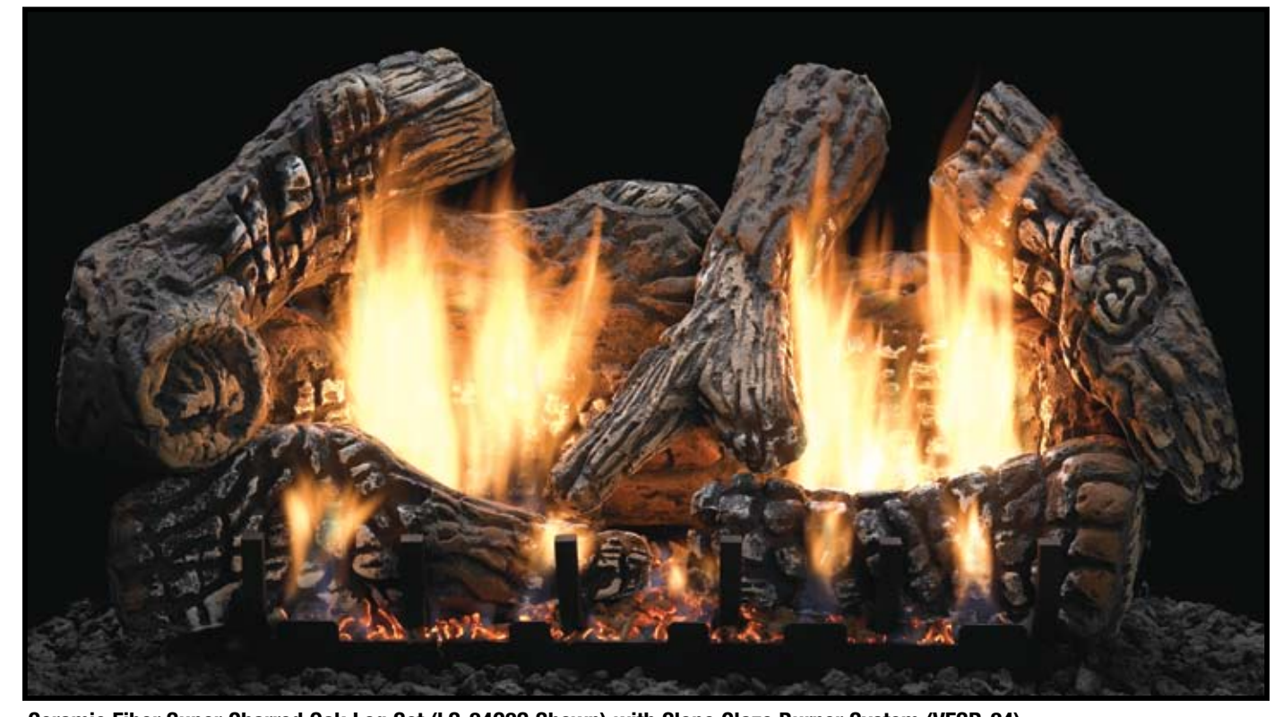
Ceramic Fiber Super Charred Oak Log Set (LS-24C2S Shown) with Slope Glaze Burner System (VFSR-24)