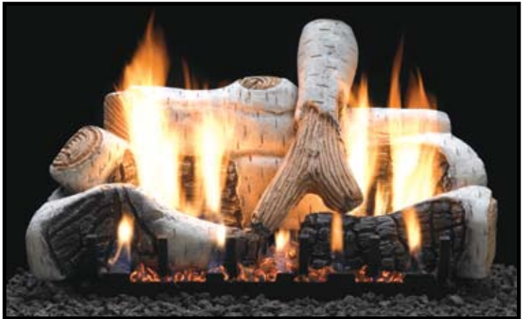
Ceramic Fiber Birch Log Set (LS-24B2) with Slope Glaze Burner System (VFSR-24)