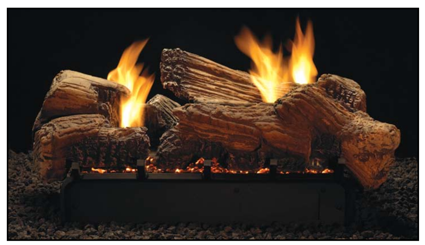
Just like a real wood fire, the Stone River ceramic fiber Log Set provides a different look from every angle. The Slope Glaze Vista Burner neatly conceals its controls behind a sliding panel.