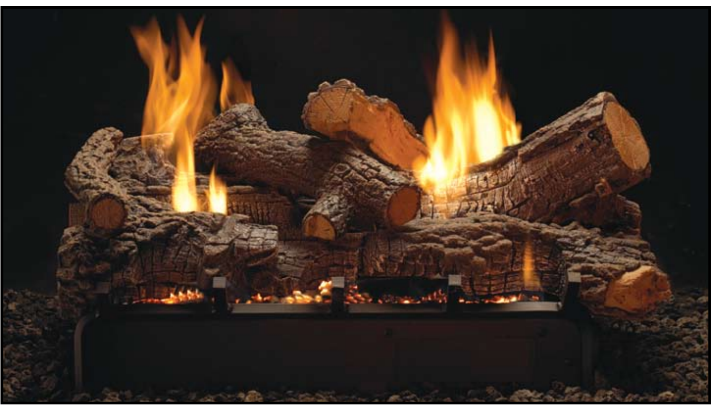
Rugged looking refractory logs, give the Rock Creek Log Set a rustic look on a grand scale.