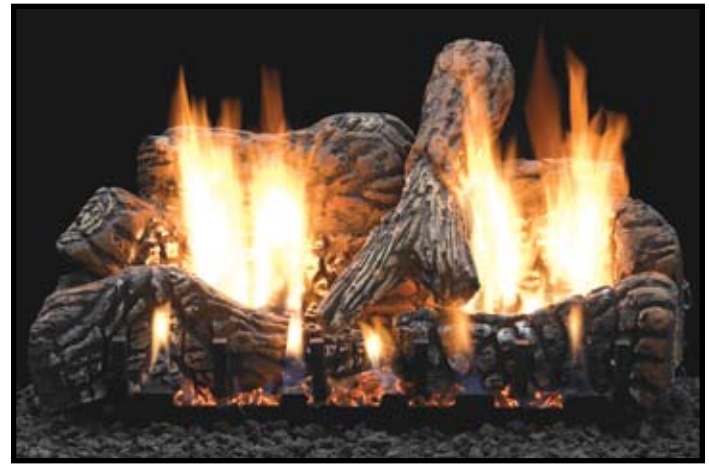
Ceramic Fiber Charred Oak Log Set (LS-24C2) with Slope Glaze Burner System (VFSR-24)

Even our manually controlled log sets offer three heat levels, so you can keep the cold winds at bay without overheating the room.