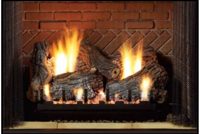
24-Inch Sassafras Log Set (LS-24RS) on Vent Free Slope Glaze Vista Burner with LR-24 Log Riser in Vent Free Select Firebox.

The Log Riser installs easily into the floor of any Vent Free firebox and is available for all sizes of Slope Glaze Vista Burners.