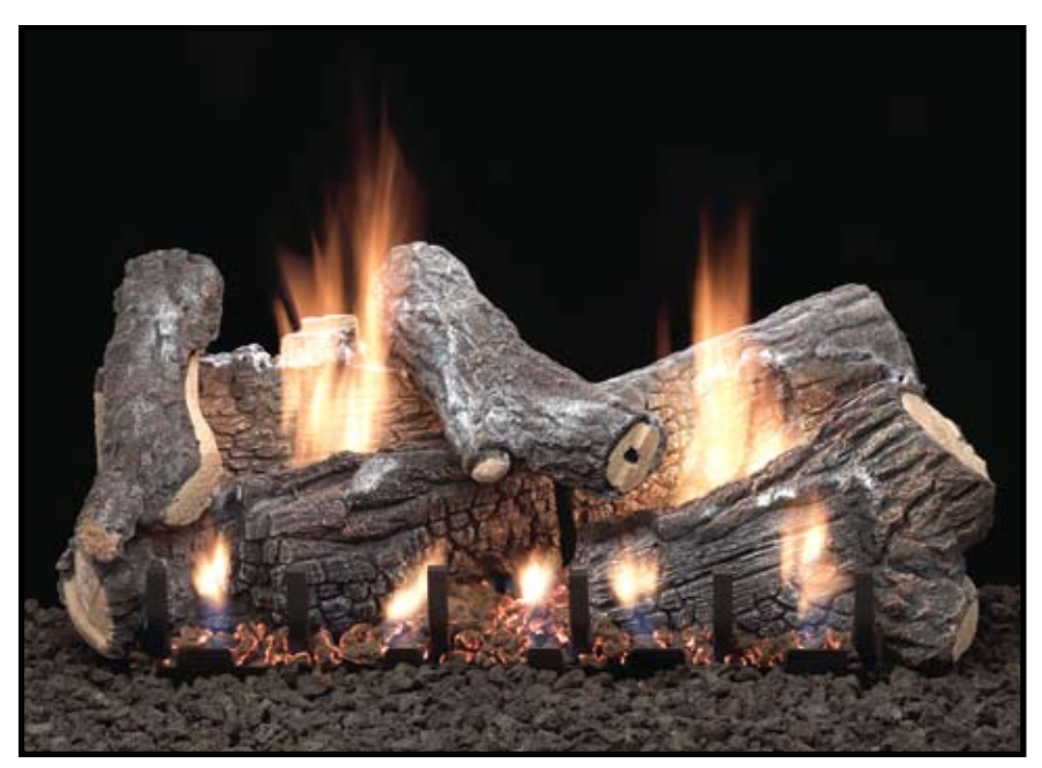
Refractory Sassafras Log Set (LS-24RS) with Slope Glaze Burner System (VFSR-24)