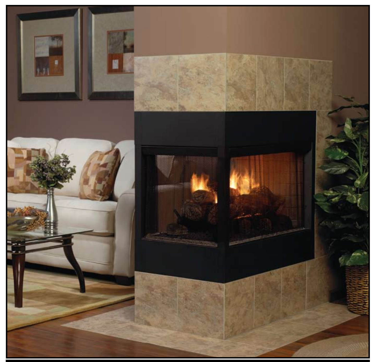
White Mountain Hearth Stone River Log Set (LSU-24SF) on a Vent-Free Slope Glaze Vista Burner. Shown in a peninsula firebox with custom tile surround. The optional Large Log Embers Kit (EK-2) and Platinum Glowing Embers (PE20) add that extra spark of realism.