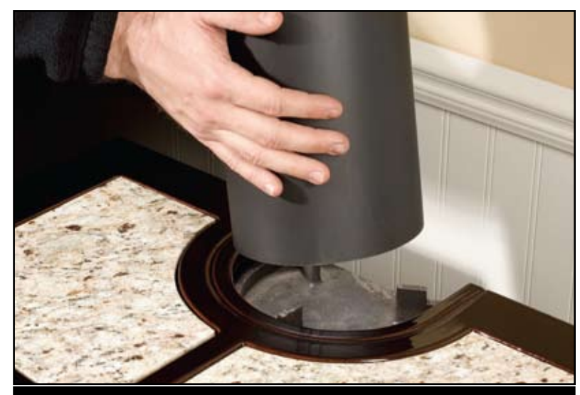
A reversible insert on vent-free Heritage Stoves accepts a non-functional vent pipe to create the illusion of a vented stove.

Your Heritage Cast Iron Stove ships assembled in one carton, for easier set-up.