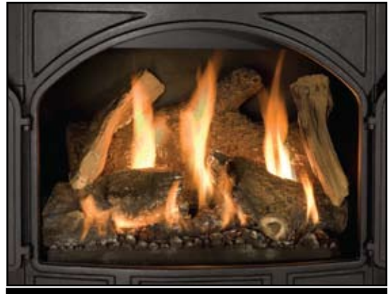
Heritage Gas Stoves include a hand-painted six-piece log set and a new burner with tall dancing flames that complements the logs.

The Heritage stove is approved to be placed on carpet, tile, and other flat surfaces without a floor pad.