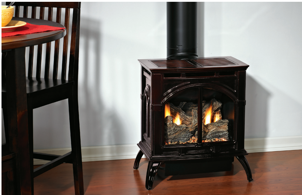
TOP LEFT: Empire Medium Direct-Vent Stove in Porcelain Black with optional Side Shelves.