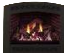
Nantucket decorative arched front—Black