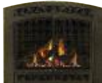
Nantucket decorative arched front—Vintage Iron and fire screen doors—Vintage Iron