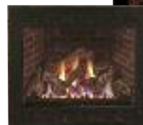
Nantucket rectangular decorative front—Black