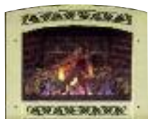
Nantucket decorative arched front—Gold Tone