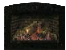
Nantucket decorative arched front—Textured Black