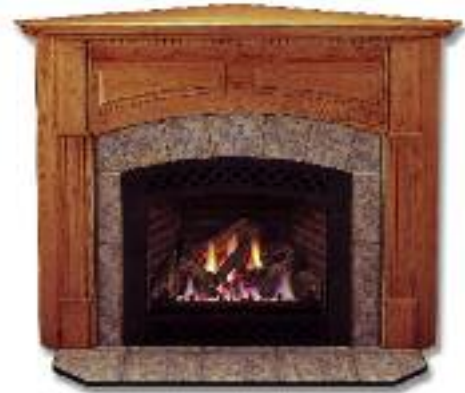
Honey Oak corner cabinet, D'Africa tile and Lexington decorative arched front—Black