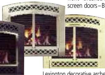
Lexington decorative arched front—Brushed Pewter and fire screen doors—Brushed Pewter