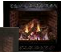
Nantucket rectangular decorative front—Textured Black