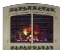
Nantucket decorative arched front—Brushed Pewter and fire screen doors—Brushed Pewter