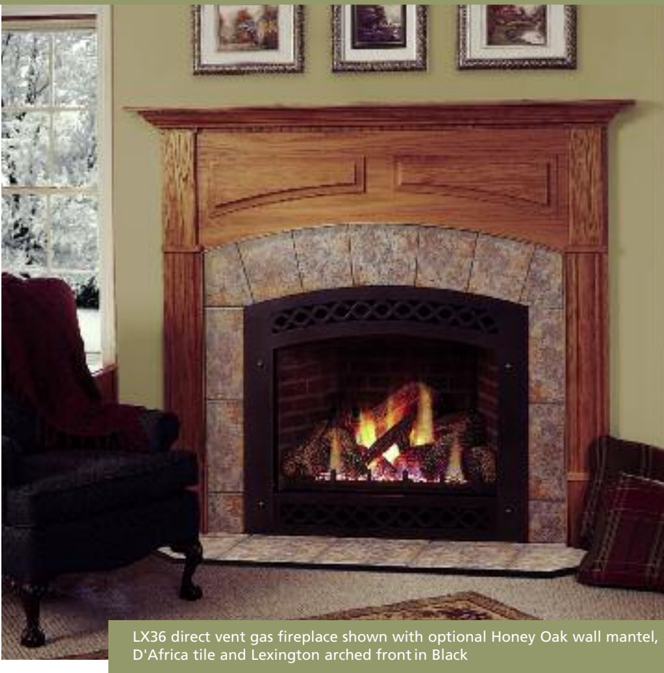
LX36 direct vent gas fireplace shown with optional Honey Oak wall mantel, D'Africa tile and Lexington arched front in Black

Install a complete system in just four easy steps and achieve the complete look of a designer fireplace.