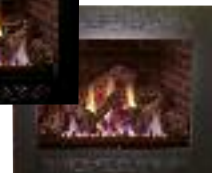
Nantucket rectangular decorative front—Vintage Iron